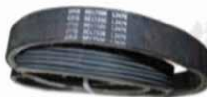
PF0419 多製帶2478 Multi-DMC with