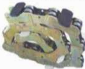
PF0409 富士达滑轮群组 Foster circumferential chain