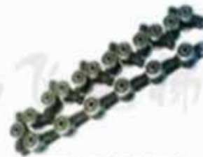
PF0408 通力滑轮群组 KONE circumferential chain