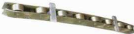
PF0411 长林滑轮群 Escalator chain wheel group