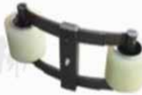
PF0404 支架总成60×55×6202×2 Hangstrap clamping device