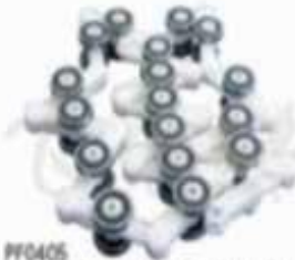
PF0405 SDS双叉滑轮群组17组/19组/21组 Bifurcated circumferential chain