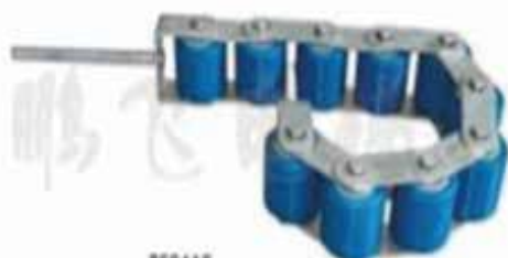
PF0416 漲緊鏈60 x 55 x 6202 x 2 Chain tensioner