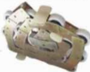
PF0410 SWE滑轮群组17组 19组等 Escalator chain wheel group