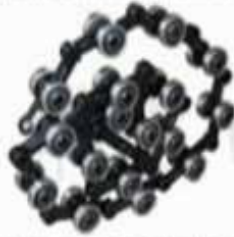
PF0406 SDS单叉滑轮群组17组、19、21 Single fork circumferential chain