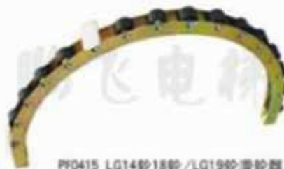
PF0415 LG14轮18轮/LG19轮滑轮群 LG Pulley group