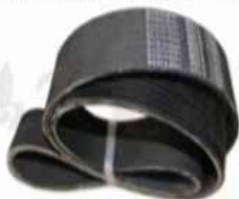
PF0418 多製帶1841 Multi-DMC with