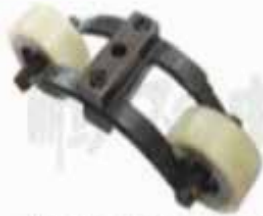
PF0403 支架总成80×35×6204 Hangstrap clamping device