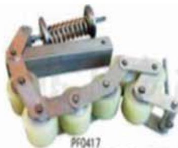
PF0417 漲緊鏈76 x 54 x 6201 x 2 Chain tensioner