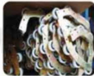
PF0412 东芝滑轮群 Escalator chain wheel group